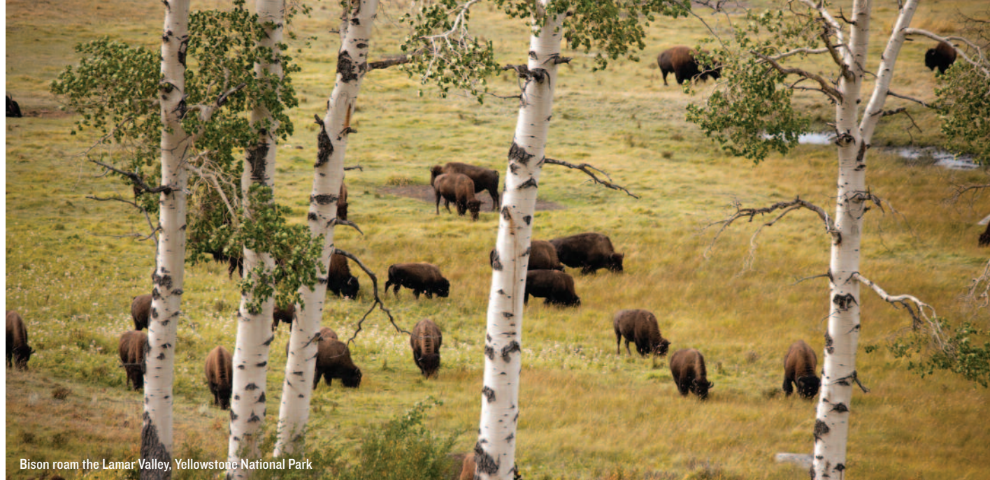
Bison roam the Lamar Valley, Yellowstone National Park

The bones alone were used for as many as 19 purposes, including tools for hide tanning, painting, saddle trees, sleds, splints, and toys. The ribs made excellent hide scrapers. Even the dung left by the great herds was used as fuel in winter.