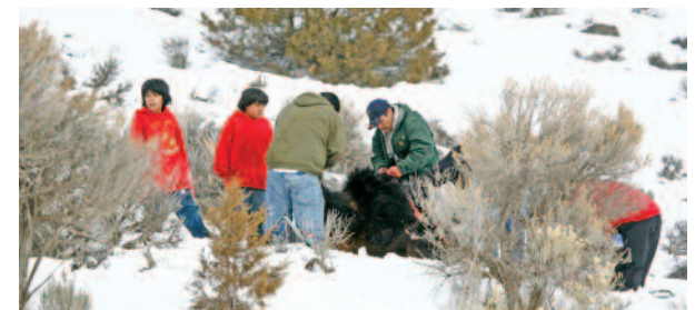
Tribal treaty hunters on a modern buffalo hunt in Montana

Today, as in the past, the tribal relationship with bison is fundamentally important. As resource managers, tribes continue to combine traditional ways of understanding with the best science and technology to expand habitat and increase tolerance for bison. As one tribal leader put it, buffalo have provided for Indian people since the beginning of time, but now the animals need help. He said it is time for tribal people to give back to the buffalo by protecting its habitat and, where they can, restoring the herds.