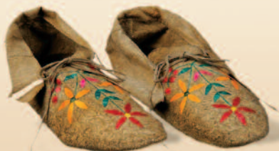
Northern plains buffalo moccasins

Tribes strive to maintain those same values today so that bison will always be at the heart of their cultures.